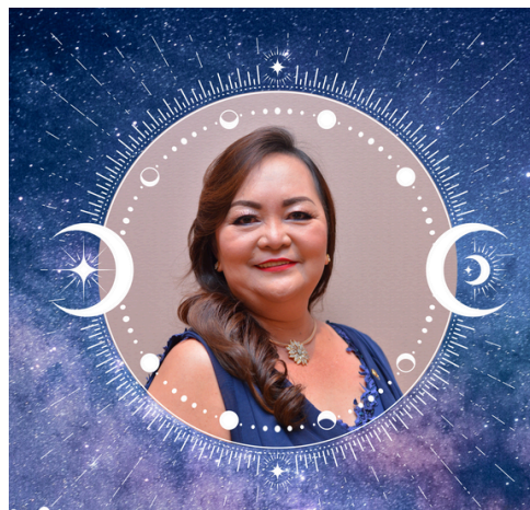
PP ANALIZA OCTOBER 27