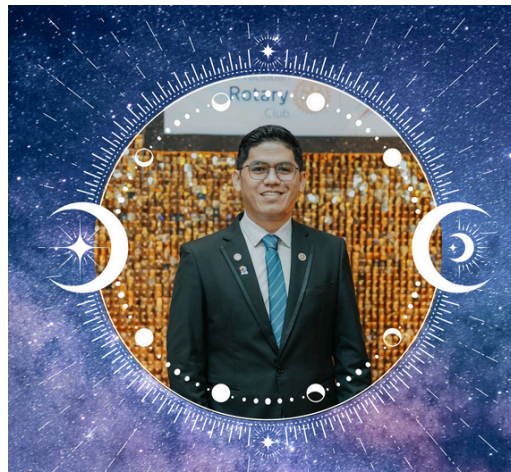
JERICO OCTOBER 22