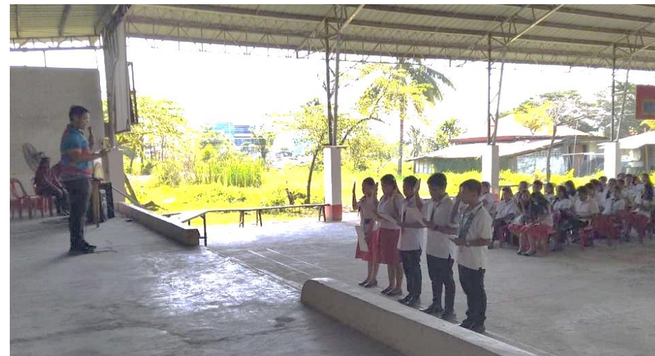
Induction of the Rotaract Club of Korbel August 13, 2019 | KFCI Campus, Koronadal City