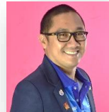
Carlo S. Precioso Foundation