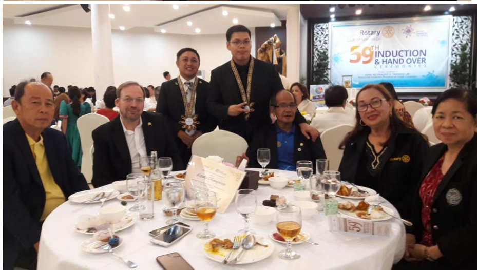
59 th Induction and Hand-over Ceremonies of the Rotary Club of Koronadal held at Maya Pavillion, Paraiso Verde, City of Koronadal last July 20, 2019