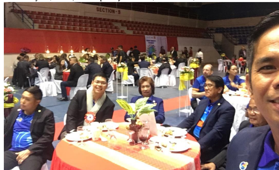
14 th Induction and Hand-over Ceremonies of the Rotary Club of Polomolok 101 July 19, 2019 | Municipal Gymnasium, Polomolok, South Cotabato