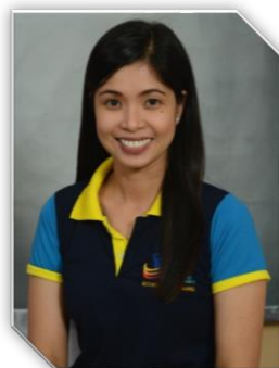
August 17 Spouse Fhar Dizon