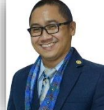
Carlo S. Precioso Foundation