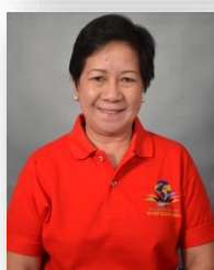
October 17 Spouse Babes Pajaro