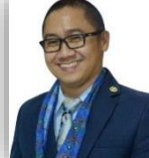
Carlo S. Precioso Foundation