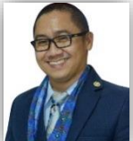
Carlo S. Precioso Foundation