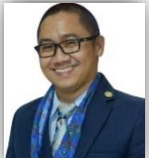
Carlo S. Precioso Foundation