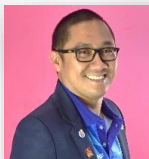
Carlo S. Precioso Foundation