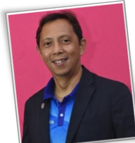
July 9 Pp Rolan Alajar