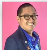
Carlo S. Precioso Foundation