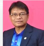
Alfredo E. dela Peña International Service