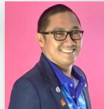
Carlo S. Precioso Foundation