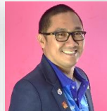
Carlo S. Precioso Foundation