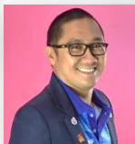
Carlo S. Precioso Foundation