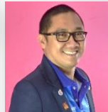
Carlo S. Precioso Foundation