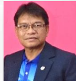
Alfredo E. dela Peña International Service