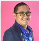
Carlo S. Precioso Foundation