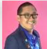
Carlo S. Precioso Foundation