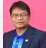
Alfredo E. dela Peña International Service