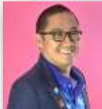
Carlo S. Precioso Foundation