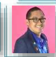
Carlo S. Precioso Foundation