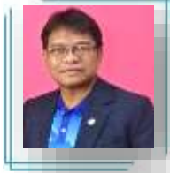
Alfredo E. dela Peña International Service