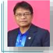
Alfredo E. dela Peña International Service