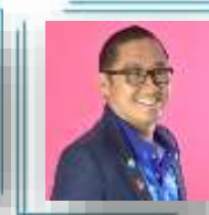
Carlo S. Precioso Foundation