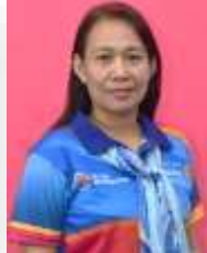
October 9 Pres. Evelyn Tampus