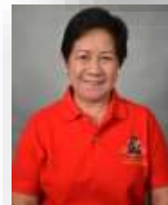
October 17 Spouse Babes Pajaro