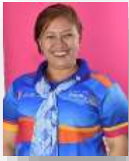
October 8 Spouse Trixy Precioso