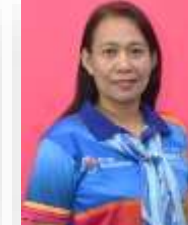
October 9 Pres. Evelyn Tampus