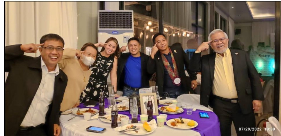
Induction and Handover Ceremonies of the Rotary Club of Polomolok 101 July 29, 2022 | The Backyard, Polomolok