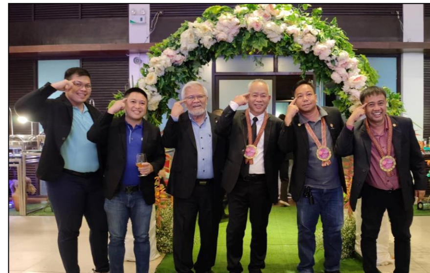
Induction and Handover Ceremonies of the Rotary Club of Midtown Gensan July 30, 2022 | Venue 88, General Santos City