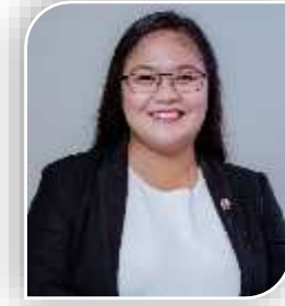
April 4 PE Ilah Labrador