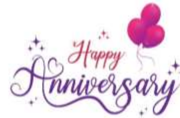
September 17 PDG Bing & Lady Nene Garcia