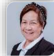
October 17 Spouse Babes Pajaro