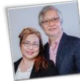
October 10 Rtn. Rem & Spouse Miles