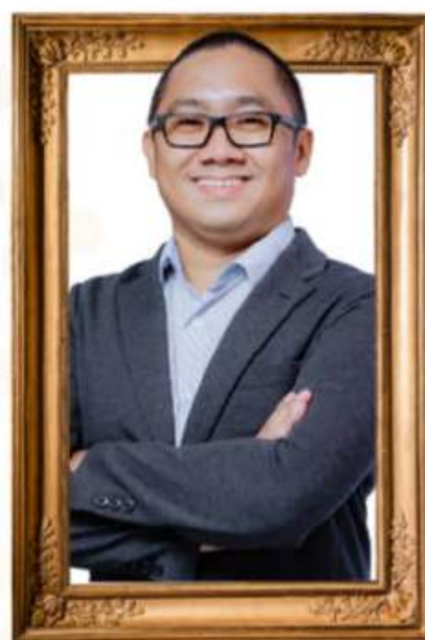
Carlo S. Precioso Foundation