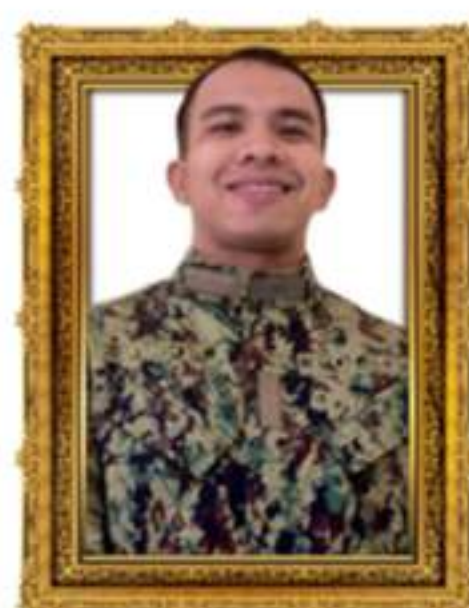
Jaj Honahlee Minion Professional Service Chair