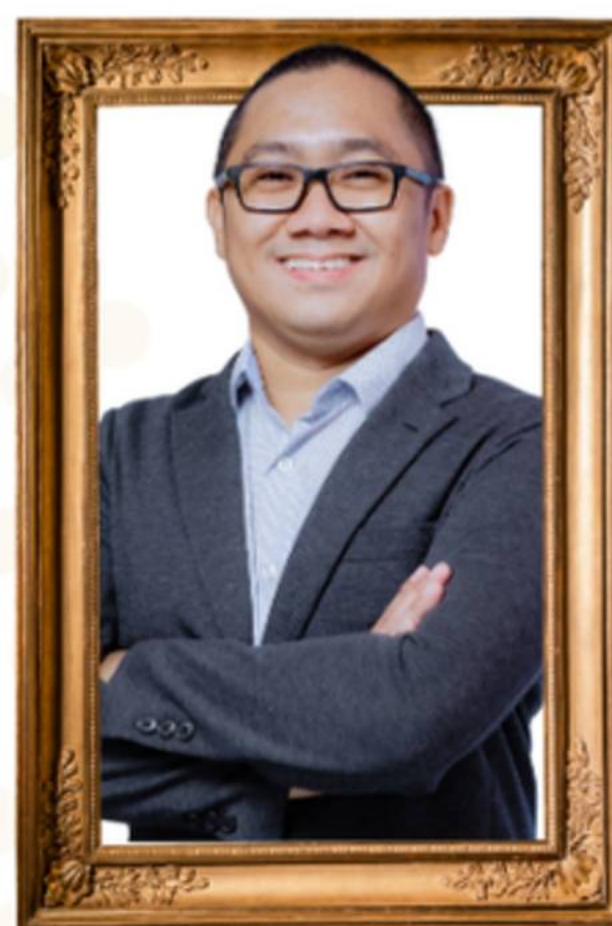
Carlo S. Precioso Foundation