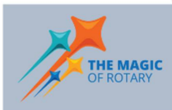
VALERIO, KEITH ALVIN, PHF 1