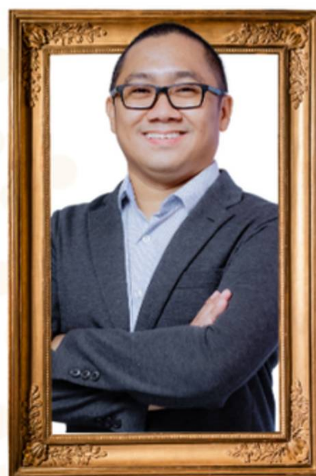
Carlo S. Precioso Foundation