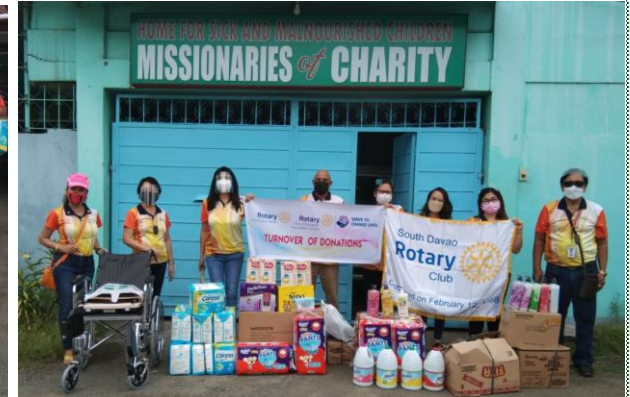
Missionaries of Charity