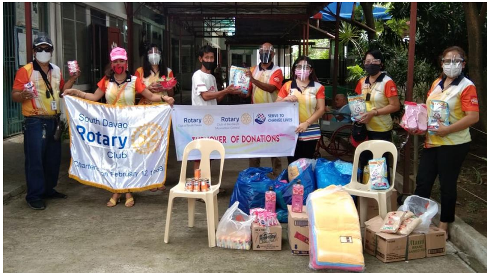
Home for the sick & elderly