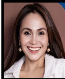
Myrtle Mae Onggao Vocational Service