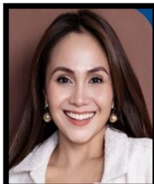
Myrtle Mae Onggao Vocational Service