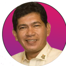
Edito Cumpio Asst. Governor Area 3B