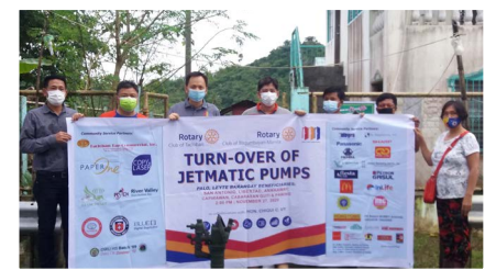
SAN ANTONIO PALO, LEYTE

NOVEMBER 27, 2020 - TURNOVER OF JETMATIC PUMP