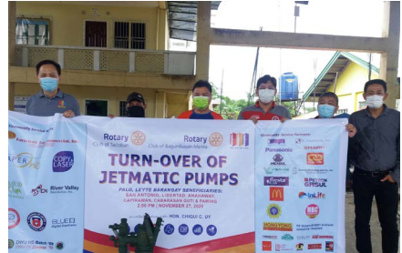
BRGY. ANAWAHAY PALO, LEYTE