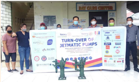
LIBERTAD PALO, LEYTE