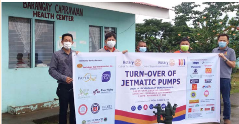
CAPIRAWAN PALO, LEYTE