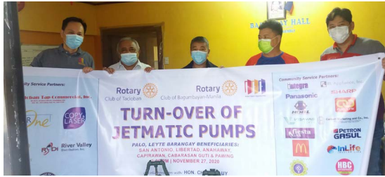
PAWING PALO, LEYTE