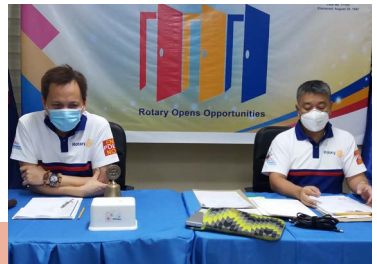
JANUARY 13, 2021 - 5TH BOARD MEETING