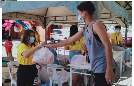
DECEMBER 23, 2020 - GIFT GIVING FOR THE LESS FORTUNATE (SACRED HEART PARISH)