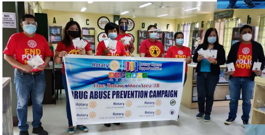
DECEMBER 22, 2020 - TURN-OVER OF 30PCS OTG USB TO DEP-ED TACLOBAN (LIBRARY HUB) WITH EMBED- DED VIDEO ON DRUG ABUSE PREVENTION PROGRAM AS AREA 3B PROJECT