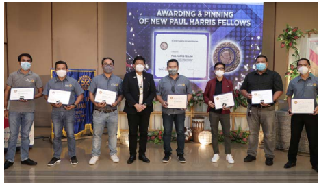
AWARDING AND PINNING OF NEW PAUL HARRIS FELLOW