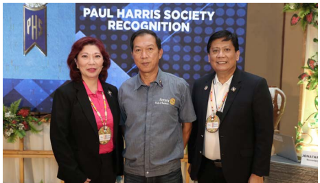
NEW PAUL HARRIS SOCIETY