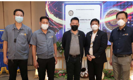
CONTINUING MULTIPLE PAUL HARRIS FELLOW