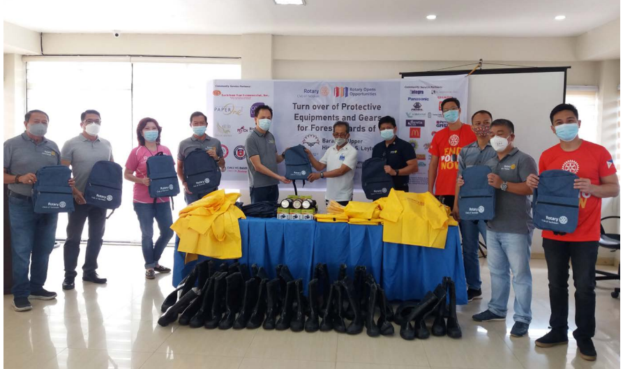
FEBRUARY 26, 2021 - TURNOVER OF PROTECTIVE EQUIPMENTS FOR FOREST GUARDS OF BRGY. UPPER, HINUNANGAN, S. LEYTE