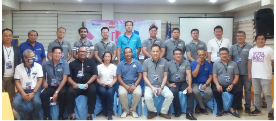
MARCH 18, 2021 - 18TH REGULAR MEETING