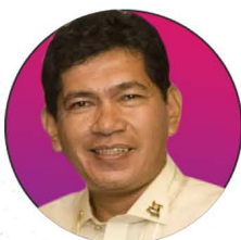
Edito Cumpio Asst. Governor Area 3B