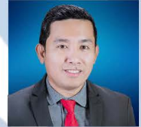
Rhoel Ladera Public Image