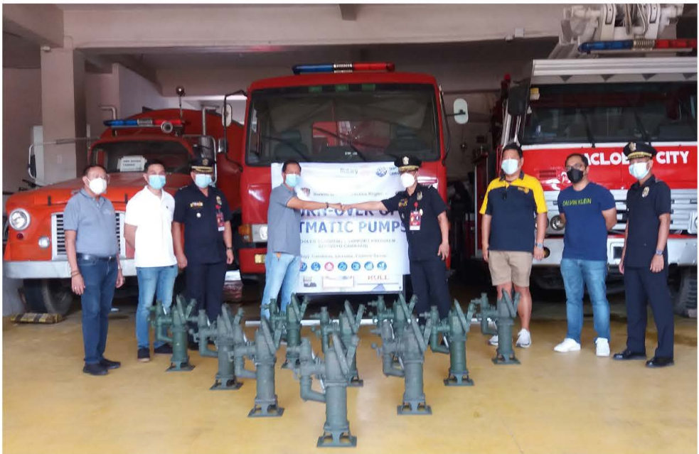
June 15, 2021 - Turnover of Jetmatic Pumps to Bureau of Fire Protection Regional Office VIII