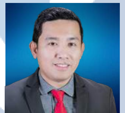
Rhoel Ladera Public Image