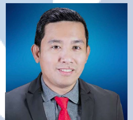
Rhoel Ladera Public Image