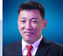
Andrew P. Ng