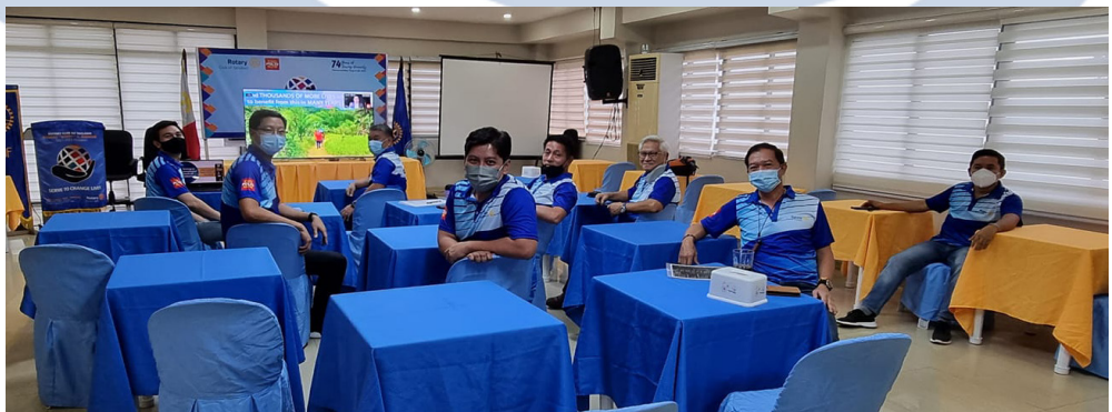
November 13, 2021 - TRF Awarding Ceremony