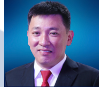
Andrew P. Ng