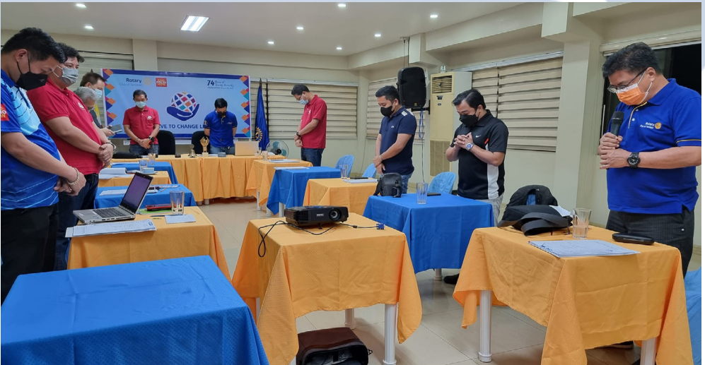
November 9, 2021 - 5th Board Meeting