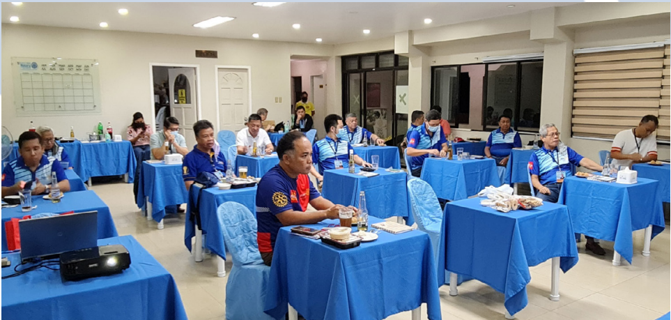
February 24, 2022 - 13th Regular Meeting