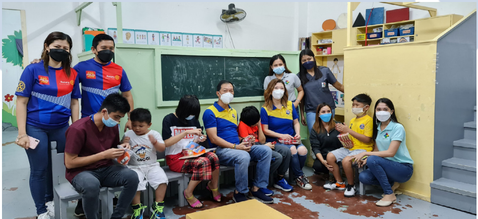
March 10, 2022 - Autism Awareness