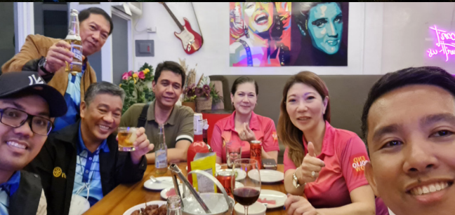
April 21, 2022 - DISTAS & Fellowship at SG Farm