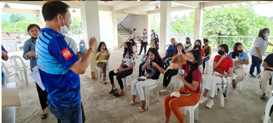
April 25. 2022 - Cosmetology Training