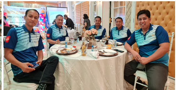
March 24, 2022 - District Governor's Visit