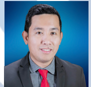
Rhoel Ladera Public Image