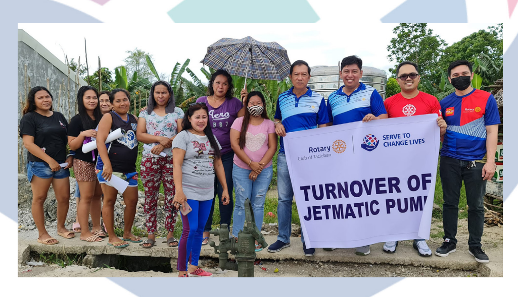
May 4, 2022 - Turnover of Jetmatic Pump to Guadalupe Heights in Brgy. Suhi, Tacloban City