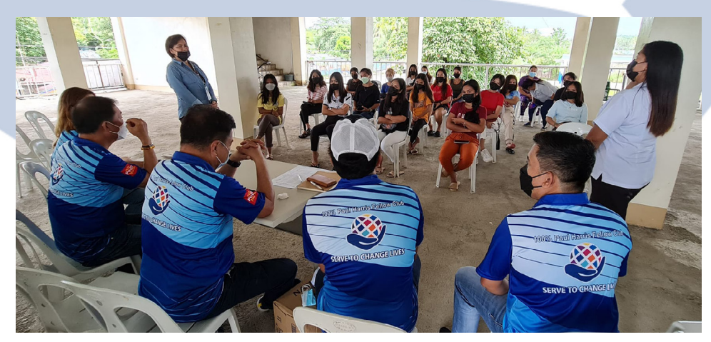
April 25, 2022 - Empowering Girls -Launching of Cosmetology Training to 20 young girls in Tacloban City Hall Extension, Tacloban North