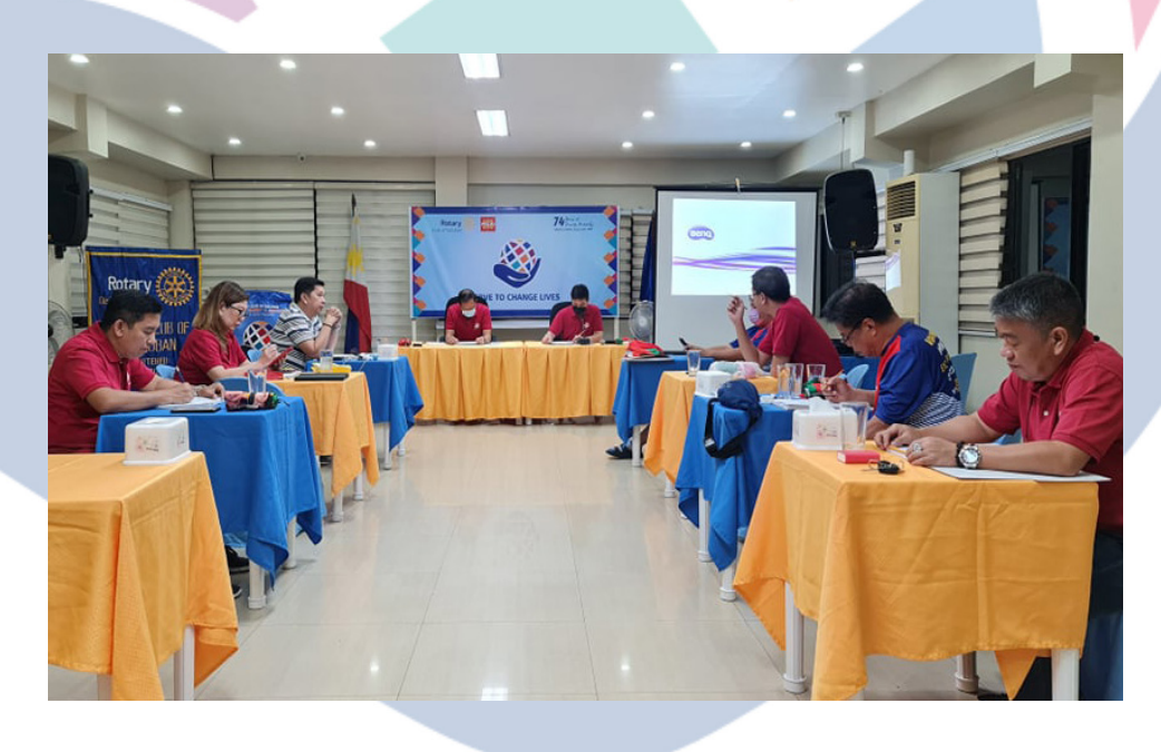
May 2, 2022 - 7th Board Meeting