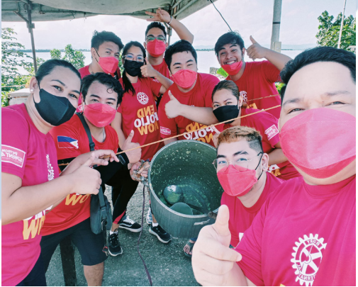
November 28, 2021 - END POLIO NOW FUN BIKE