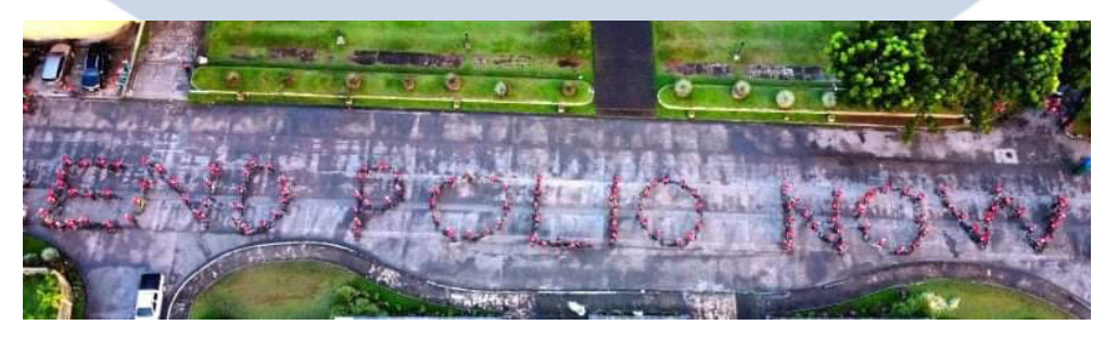
November 28, 2021 - END POLIO NOW FUN BIKE